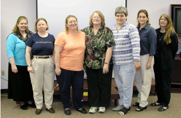
Officers for 2001-2003