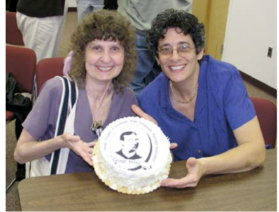
Our guest speakers with one of the Anniversary cakes