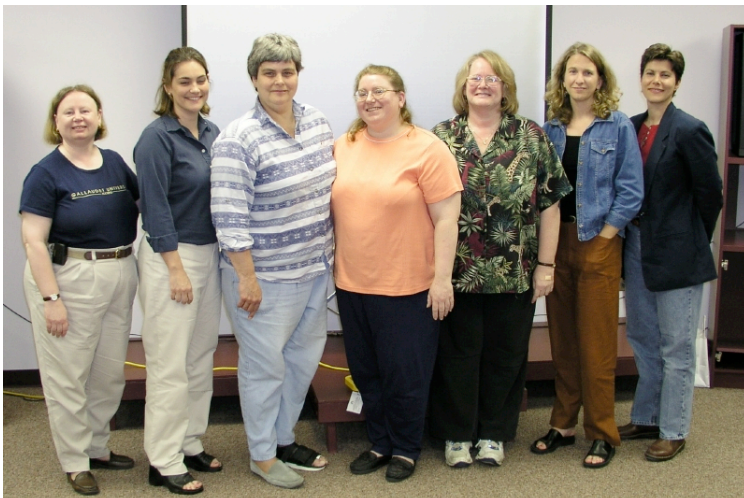
Officers for 2003-2005