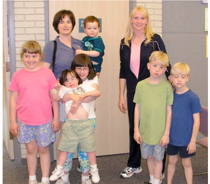
Audience members at Deaf Humor 2004