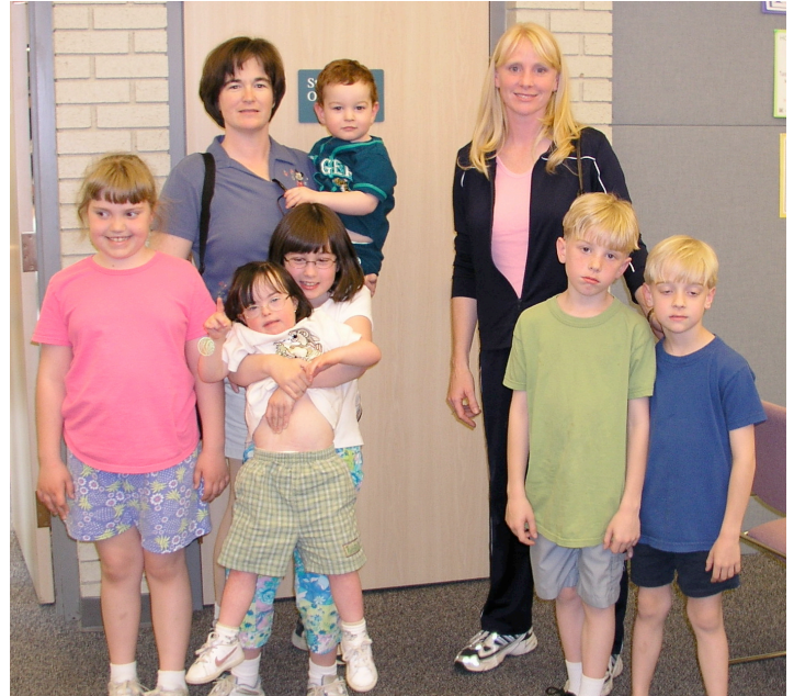
Audience members at Deaf Humor 2004