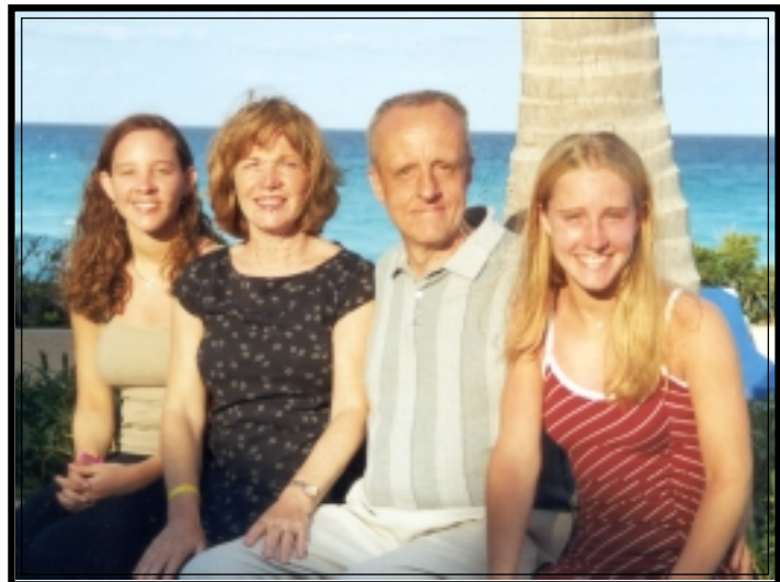
Cancun, 2000 Ocean View